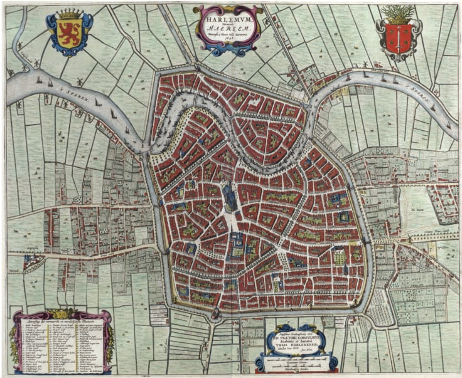
PLATE 51. PLAN OF HAARLEM PUBLISHED BY JOAN BLAEU. (See p. 1335.) Size of the original: 46 X 56.5 cm. Joan Blaeu, Novum ac

magnum theatrum urbium Belgicae liberae ac foederatae (Amsterdam: I. Blaeu, 1649). Photograph courtesy of the Universiteitsbibliotheek Amsterdam (1800 A 9).