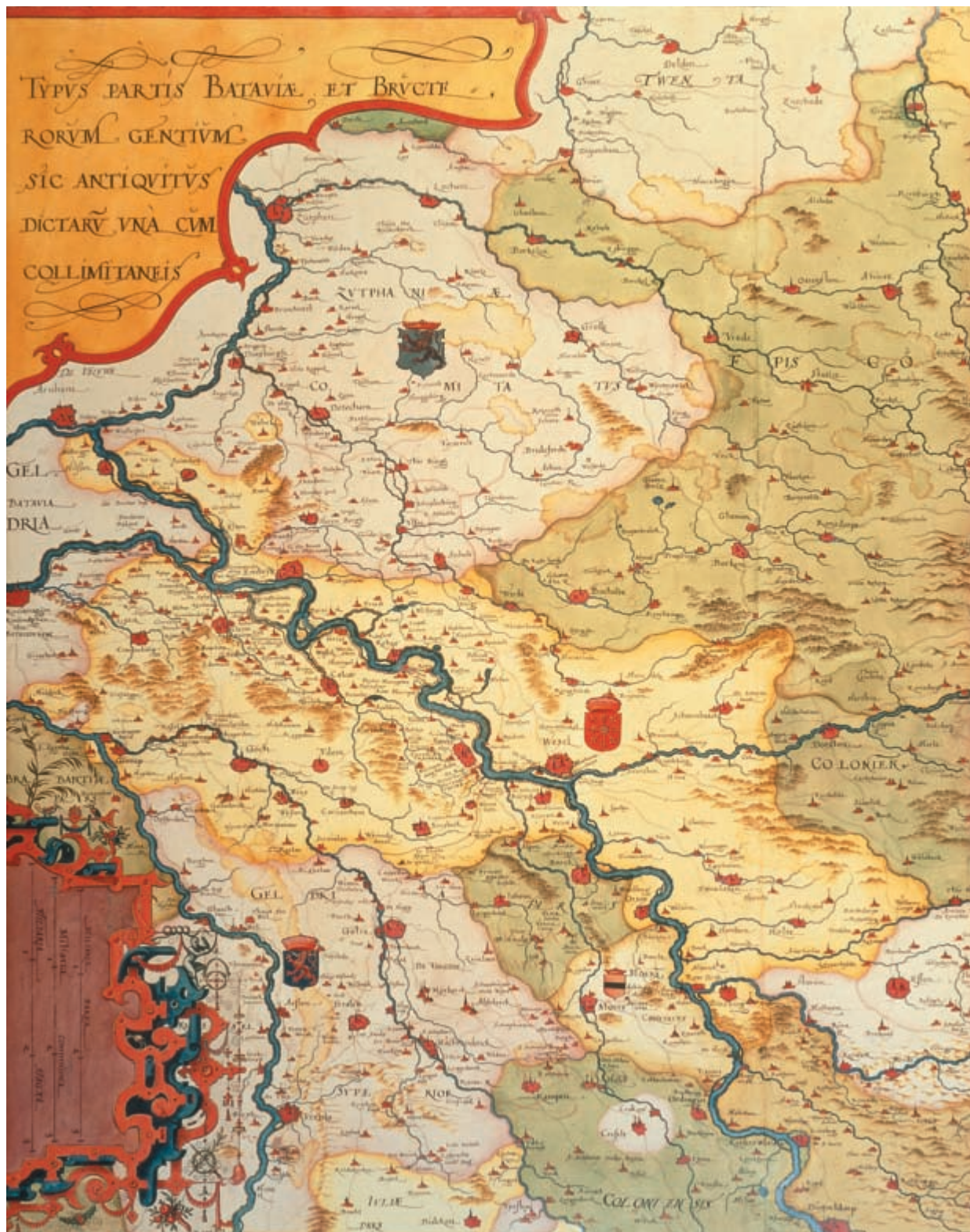
PLATE 47. DETAIL FROM THE MAP OF THE LOWER RHINELANDS BY CHRISTIAAN SGROOTEN. (See p. 1234.) The so-called Madrid Atlas (finished in 1592) was the sum of Sgrooten's lifework. This example shows a section from map number 32 (of Lower Rhineland and Westphalia), a nearly perfect symbiosis of cartographic exactness and pictorial style.

Almost all of the individually designed miniature images of the towns are close to reality. Drawn with ink and watercolors on paper. Size of the entire original: 73.5 X 115 cm. Photograph courtesy of Biblioteca Nacional, Madrid (MS. Res. 266, p. 196).