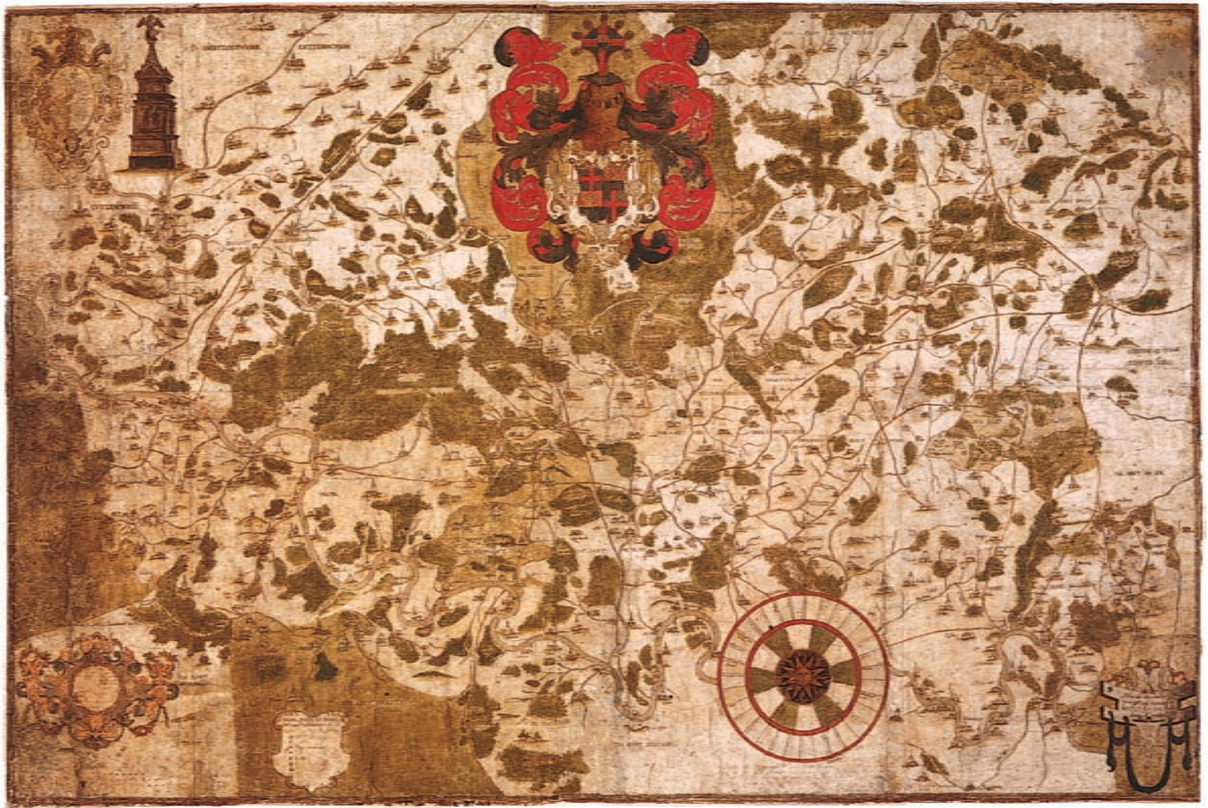
PLATE 46. ARNOLDUS MERCATOR'S MAP OF TRIER. (See p. 1225.) Drawing with ink and oil color on paper.

Size of the original: 85 X 130 cm.