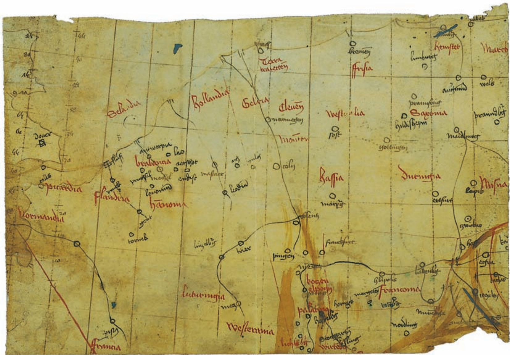
PLATE 43. KOBLENZ MAP FRAGMENT. (See p. 1179.) Having survived in an old binding, this fragment of an otherwise lost map shows Central Europe north of Paris and Nuremberg between Normandy and Brandenburg. The fragment dates from the second half of the fifteenth century and was executed in

southern Germany. Parchment with inscriptions in red and black ink. Size of the original: 19.5 x 29 cm.