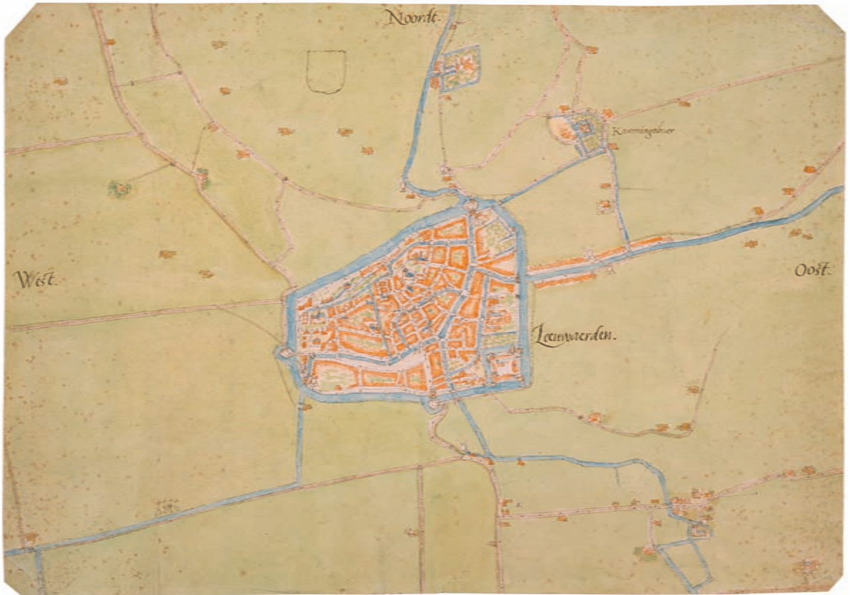
PLATE 49. JACOB VAN DEVENTER, MANUSCRIPT TOWN PLAN OF LEEUWARDEN, CA. 1560. (See p. 1274.)

Size of the original: 29.9 X 42.6 cm.  (inv. nr. D.20).