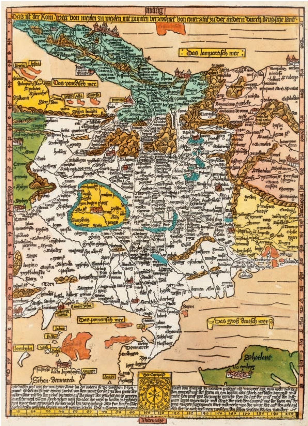
PLATE 44. ERHARD ETZLAUB'S ROM WEG MAP, 1500. (See p. 1194.) This first road map by Etzlaub appeared on the occasion of the Holy Year 1500. Dotted lines show the routes

for pilgrims from northern and central Europe to Rome. Size of the original: 40.5 X 29.5 cm. Photograph courtesy of the Bayerische Staatsbibliothek, Munich (Rar. 287, fol. 331ar).