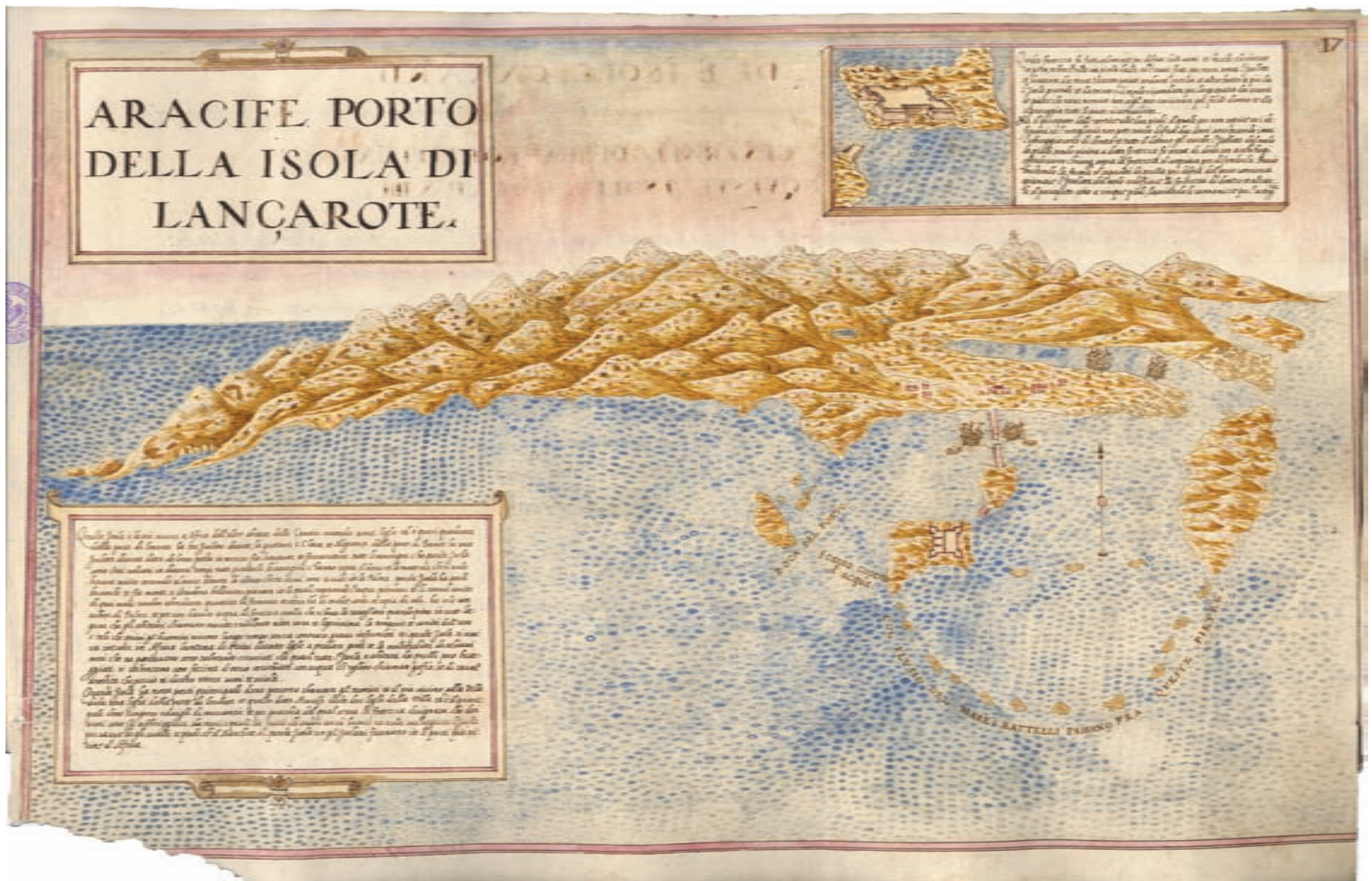
PLATE 41. LEONARDO TORRIANI, VIEW OF ARRECIFE FROM HIS “DESCRITTIONE.” (See p. 1147.) This plate is from Torriani’s descriptive atlas of the Canary Islands. Other plates show not only fortifications, drawn in detail, but also

images of the indigenous people; Torriani seems to have had unusually wide interests, which he expressed visually. Size of the original: 24.5 X 39.4 cm.