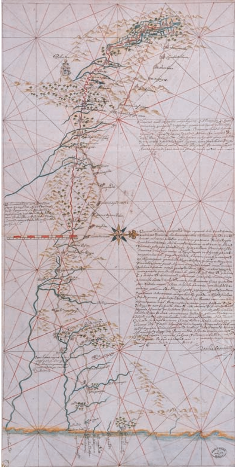
PLATE 42. BAUTISTA ANTONELLI, MAP OF THE ROAD FROM VERACRUZ TO MEXICO CITY, 1590. (See p. 1158.) This map is typical of the engineer's work in its meticulous delineation of roads and settlements, and was probably drawn to give the king and his councilors an idea of one of the great

strategic routes in New Spain. Size of the original: 81 X 41 cm. Photograph courtesy Spain, Ministerio de Cultura, Archivo General de Indias, Seville (MP-México, 39).