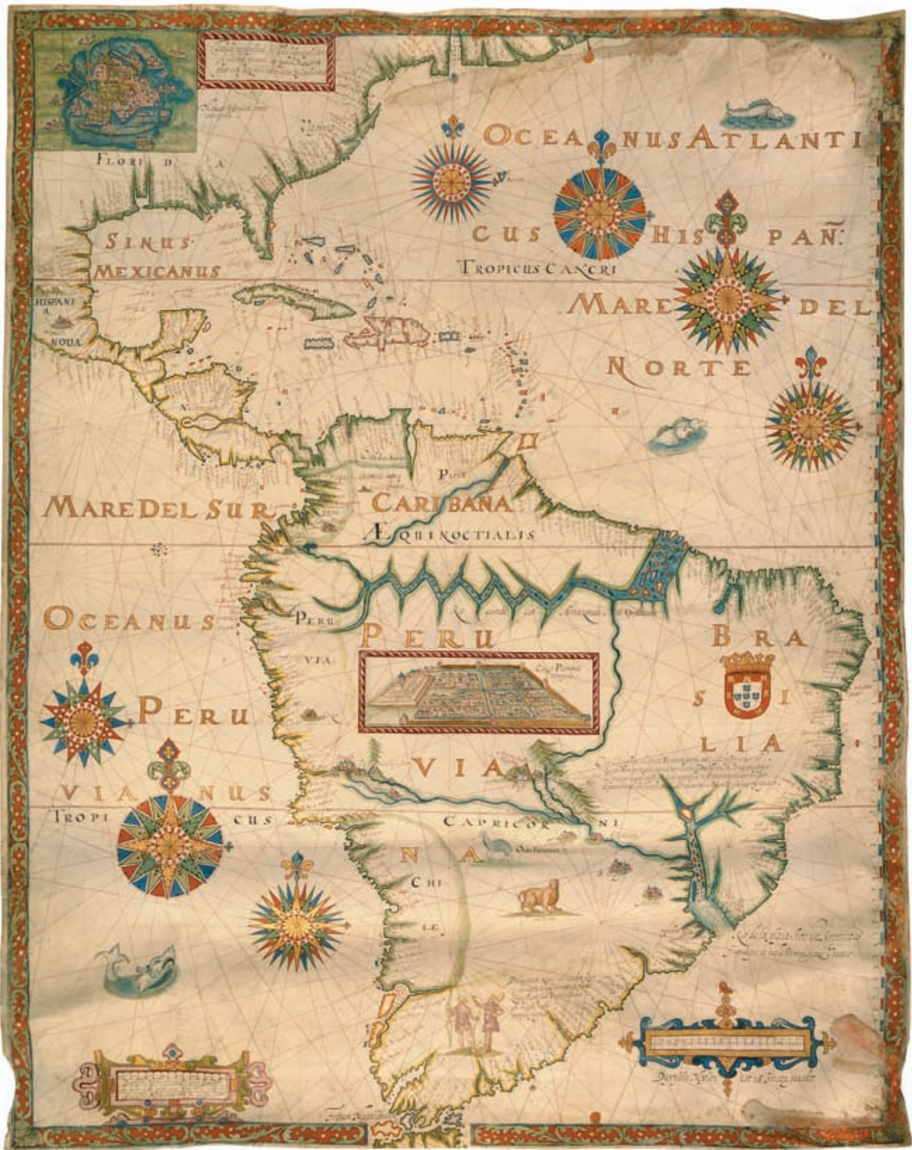
PLATE 55. EVERT GIJSBERTSZ., MANUSCRIPT CHART OF CENTRAL AMERICA AND SOUTH AMERICA, BEFORE 1596. (See p. 1419.)

Size of the original: 112 X 88 cm. Photograph courtesy of the Koninklijke Bibliotheek, The Hague (78 B 28).