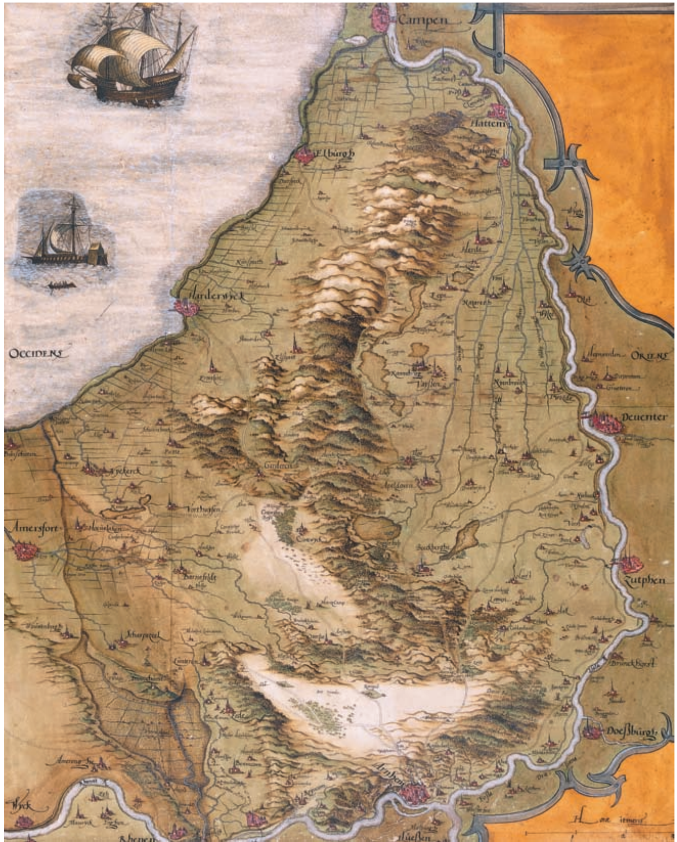
PLATE 50. CHRISTIAAN SGROOTEN, REGIONAL MAP OF VELUWE, CA. 1568–73. (See p. 1276.)

Size of the original: 59.5 X 48 cm. (MS. 21596, fol. 30r).