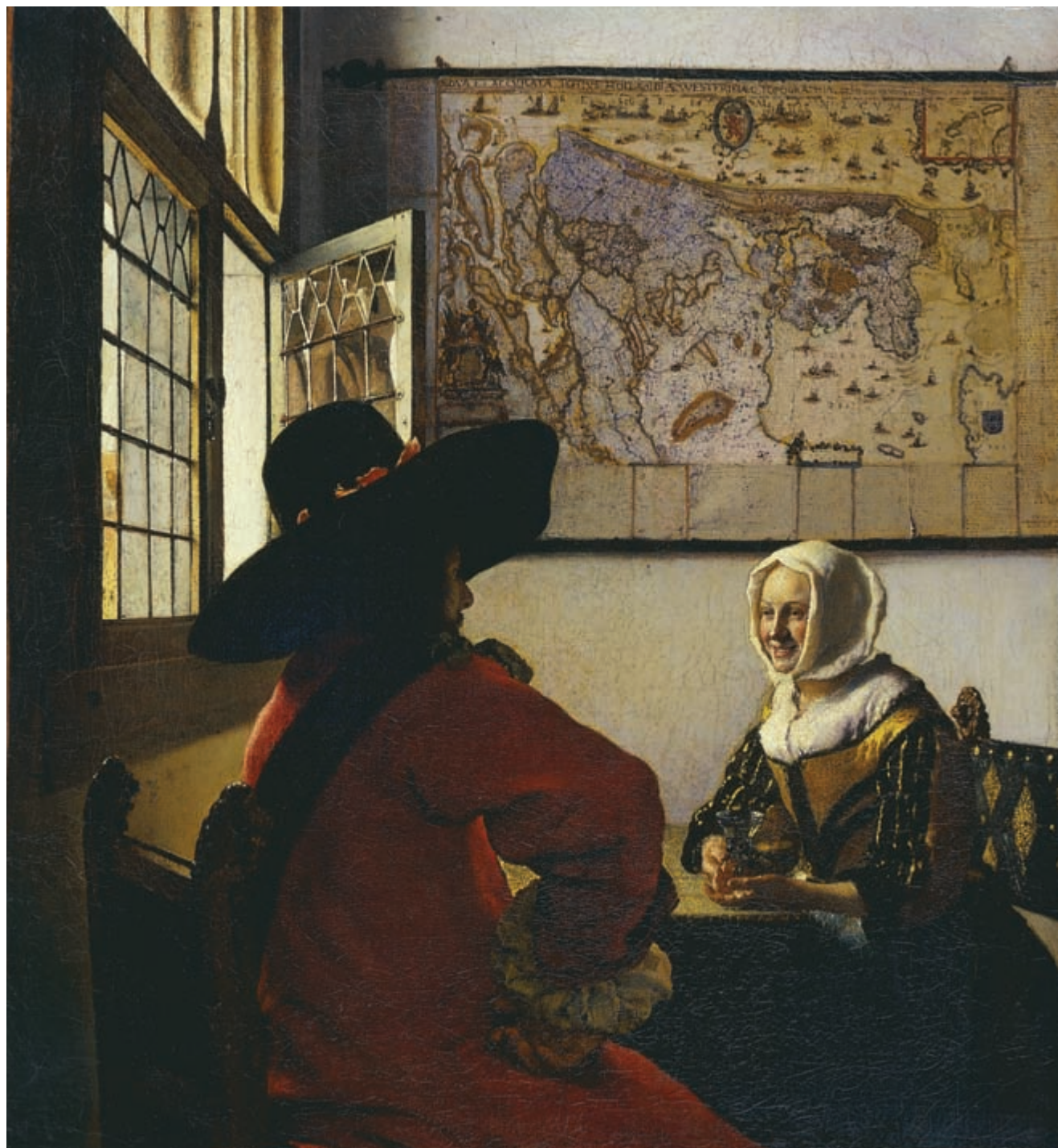
PLATE 52. JAN VERMEER, OFFICER AND LAUGHING GIRL , CA. 1658. (See p. 1342.)

Size of the original: 50.5 X 46 cm.  (acc. no. 11.1.127).