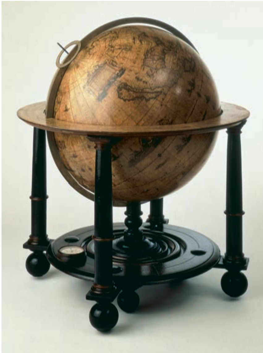
PLATE 53. WILLEM JANSZ. BLAEU, TERRESTRIAL AND CELESTIAL GLOBES, 1616. (See p. 1367.) Diameter of the globes: 68 cm.