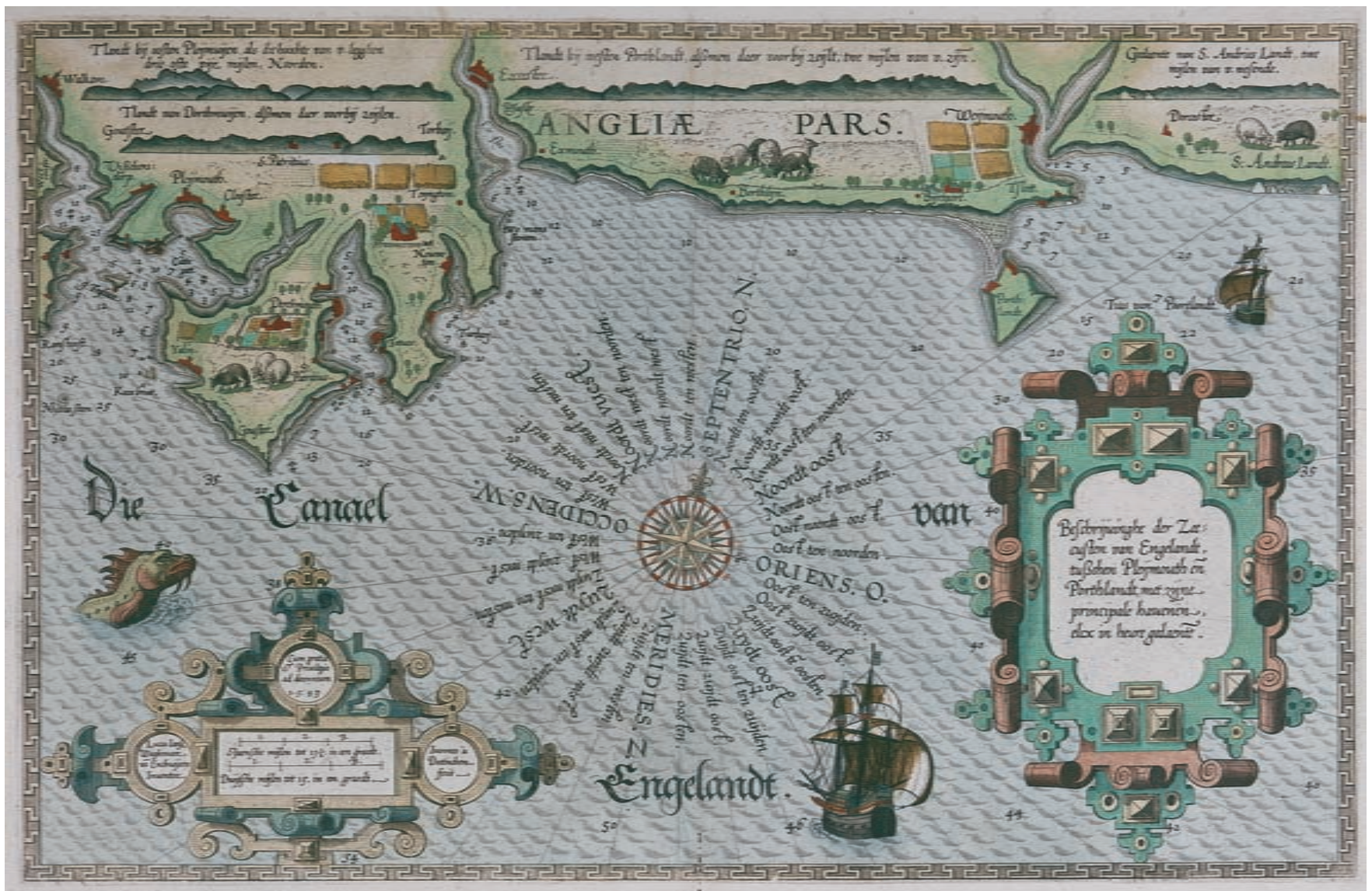
PLATE 54. CHART FROM LUCAS JANSZ. WAGHENAER'S SPIEGHEL DER ZEEVAERDT, 1584. (See p. 1393.)

Size of the original: 33 X 52 cm. Photograph courtesy of the Maritiem Museum, Rotterdam (WAE 104, following fol. 21).