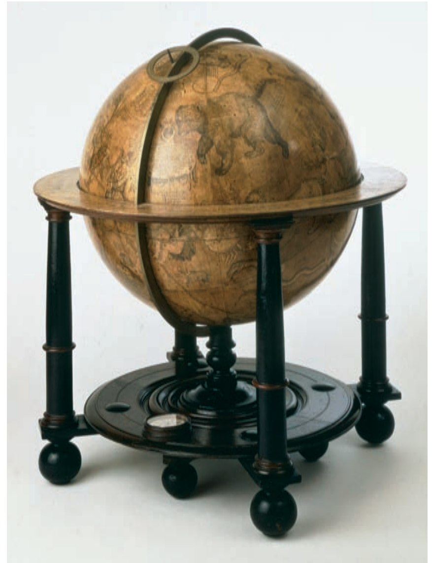
Amsterdams Historisch Museum (inv. no. KA 14781 and KA 14782).