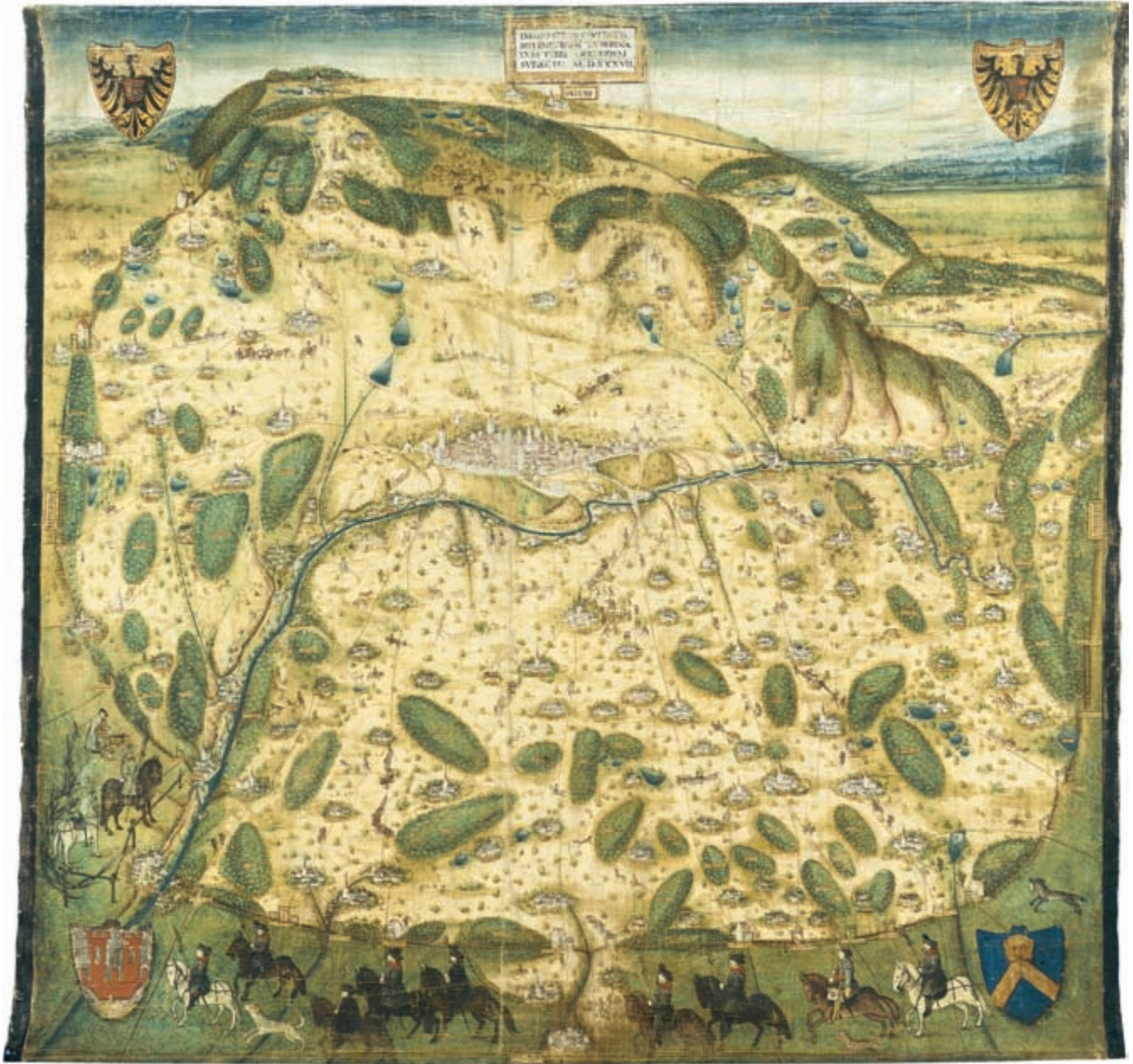
PLATE 45. THE LANDTAFEL OF ROTHENBURG, 1537. (See p. 1222.) “Imago situs civitatis Rotenberg. Tuberinae,” a bird’s-eye view of the territory of the imperial city of Rothenburg ob der Tauber by the local painter Wilhelm Ziegler. It is an early example of a non-metrical Landtafel in the immediate

tradition of landscape painting. Drawing with ink and opaque water color on linen. Size of the original: 161 X 163 cm.