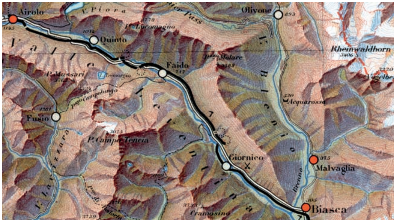
FIG. 442. DETAIL FROM SHEET 4 OF THE SCHULWANDKARTE SUISSE SCHWEIZ SVIZZERA , 1902, 1:200,000. Lithography by Hermann Kümmerly, printed at Kümmerly & Frey, Bern, Switzerland.

The firm's products addressed a broad range of uses, from travel and tourism to education and reference. In 1895 the firm published Officielle Eisenbahnkarte der Schweiz 1:500,000, the official road map of Switzerland; in 1902, its popular 1:200,000 school wall map, which remained in use for more than eighty years (fig. 442). In 1911 Kümmerly & Frey absorbed Heinrich Keller's Zurich-based cartographic firm, Kartographische Anstalt, and established itself as the leading geographical publisher of Switzerland. The company published innumerable cantonal school wall maps and Schulhandkarten (maps used at students' desks), as well as a successful series of road maps (the so-called Blues, based on