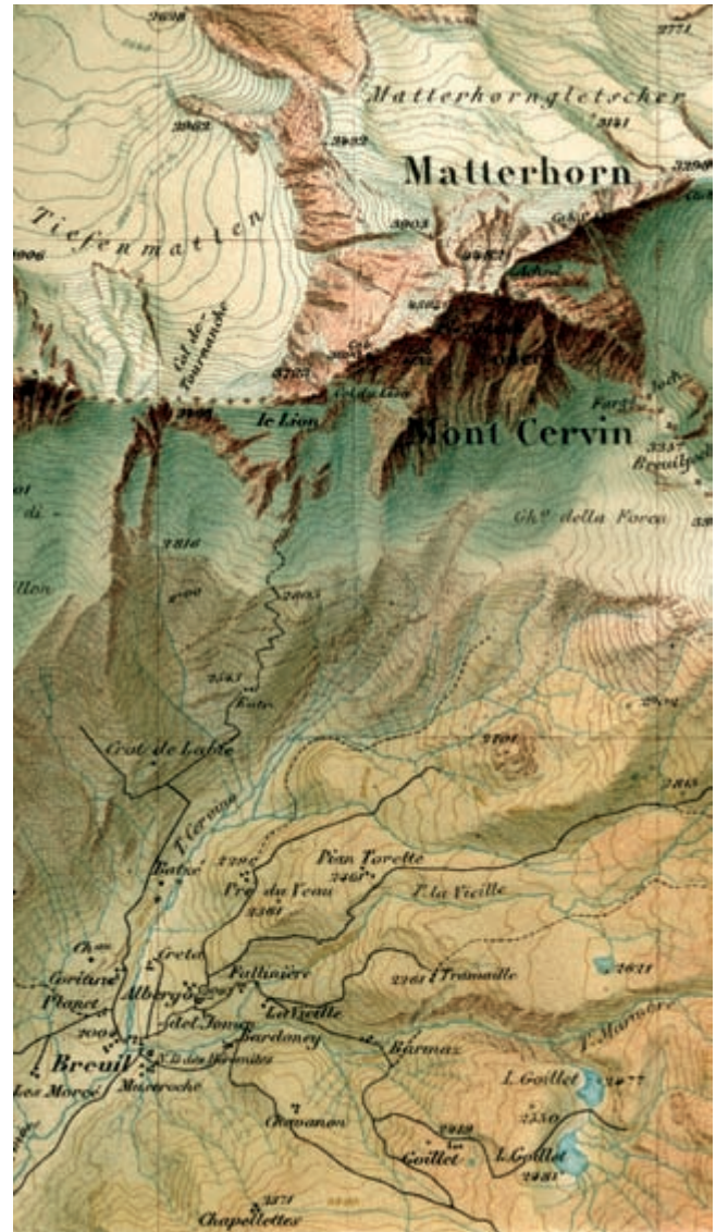
FIG. 441. DETAIL OF THE EVOLENA-ZERMATT-MONTE ROSA, 1892, 1:50,000. Stone engraving by Rudolf Leuzinger, lithography and print by Gebrüder Kümmerly, Bern, Switzerland.

relais de la post-aux-chevaux de la Confédération Suisse , a general map of the horse-drawn postal service and its stations, was published as his first cartographic product. In 1869 Kümmerly moved from his original location, in Marktgasse 32 in the old town center, to Hallerstrasse 6, and in 1877 he acquired a second lithographic press. For many years, Kümmerly printed topographical maps at a 1:50,000 scale for the Eidgenössisches Topographisches Bureau (today the Bundesamt für Landestopografie swisstopo), which did not possess a lithographic press at the time. After Kümmerly's death in 1884, his