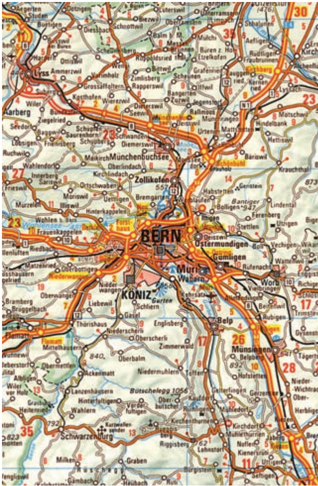
FIG. 443. DETAIL FROM THE OFFIZIELLE STRASSENKARTE DER SCHWEIZ , 1984, 1:301,000. Bern and its surroundings—a complicated mix of highways, minor roads, and railways, and the river flowing through the city. Bern: Kümmerly+Frey. Size of the entire original: 91.6 × 125.4 cm; size of detail: 8.4 × 12.8 cm.

the color of the map cover), hiking maps, bicycle maps, city maps, panoramic maps, general maps, and atlases. The topographic basis for Kümmerly+Frey's maps were the Bundesamt für Landestopographie's maps, which were modified and edited to fit the firm's templates. Because of copyright issues and related reproduction charges, the general map of Switzerland, from 1981 on-